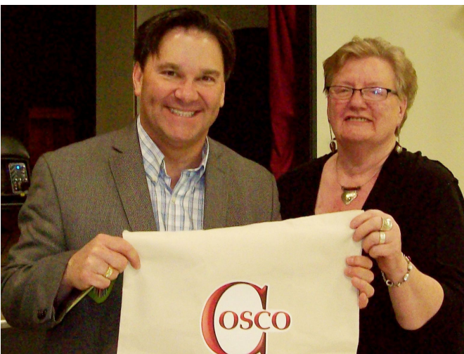
MP Don Davies receiving his 'thank you token' for his talk to COSCO Delegates about pharmacare