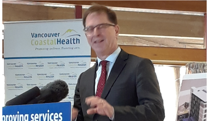
The Hon. Adrian Dix, Minister of Health Announcing the plan for a long term care, residential facility to house 160 seniors