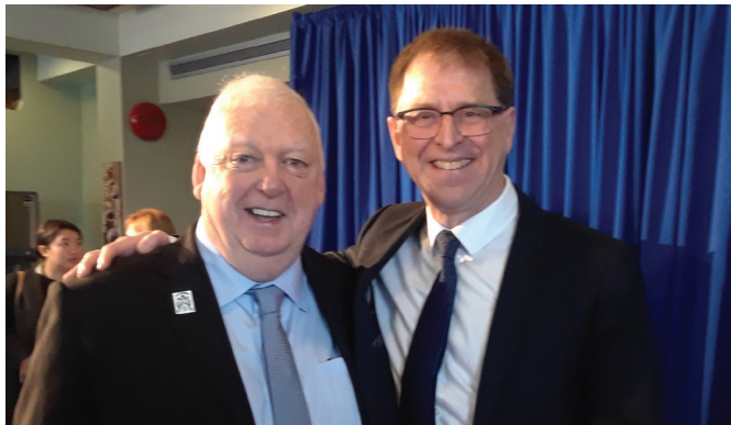
At the Peace Arch Hospital announcement of construction of improved Emergency department and primary care