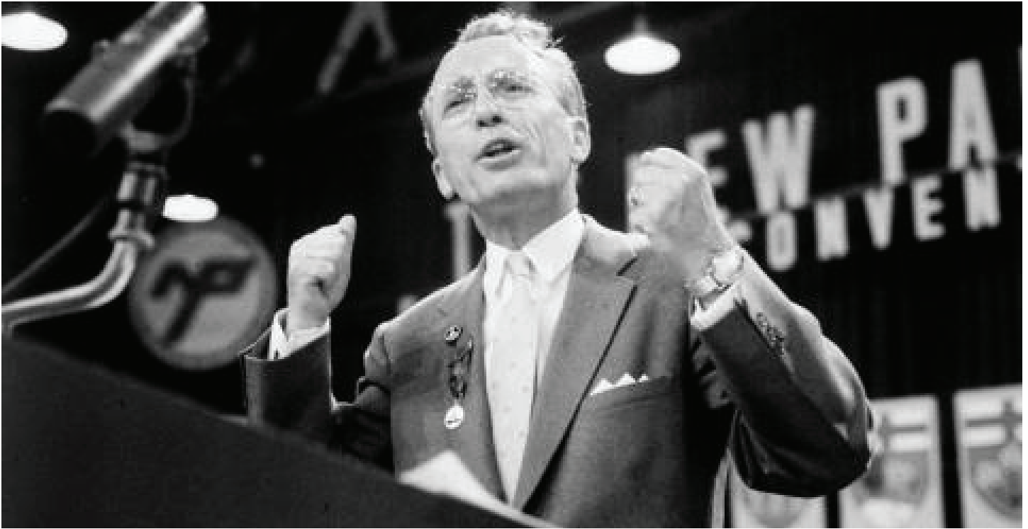
Tommy Douglas, Canada's "Father of Medicare."

T HANKS TO CANADA'S universal health-care system, most Canadians have never had to worry about paying medical bills. Everyone gets the care they need, at a cost far below the hit-or-miss U.S. health-care system. It's little wonder that 94 percent of Canadians boast proudly about their national health care—even more than they hoot about hockey.