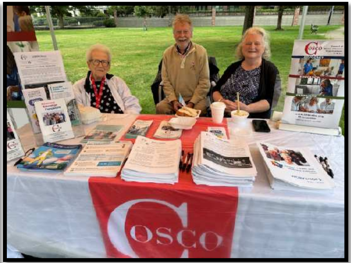
COSCO executive members at the Langley Global Fest event August 2024